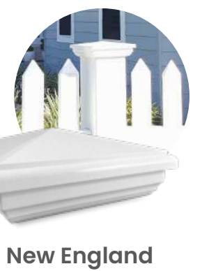
Vinyl Post Cap