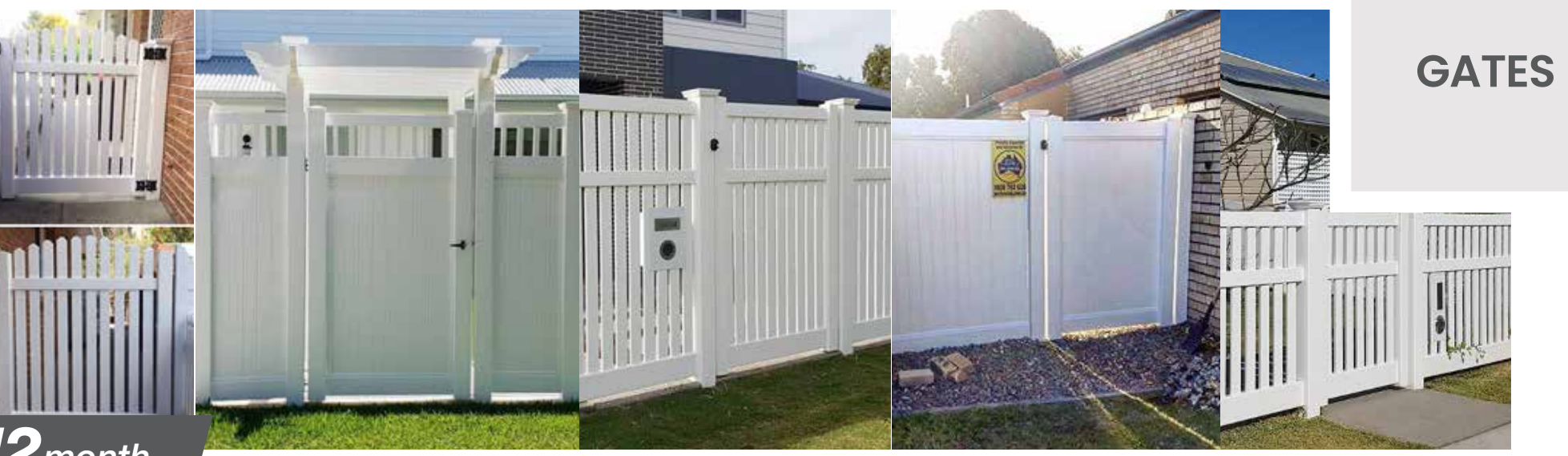
12month GATE WARRANTY*

Create a custom arbour to accent the entry to your home! All arbours come with the 50year guarantee as with all PVC Fencing products.