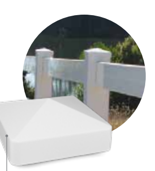
Pvramid Vinyl Post Cap