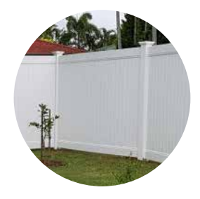
Full-Privacv The perfect privacy solution that provides an acoustic barrier with a neat Hampton style finish.

Semi-Privacy Looking for a fence that doesn't block the view? Find the perfect style to accentuate your home.