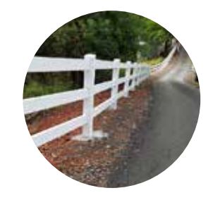
Ranch Style Attractive post and rail fences, ideal for retaining horses, sensitive livestock or simply for the look.